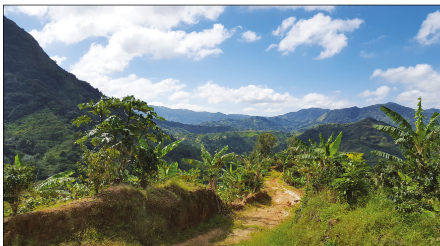
Figure 4. A coffee farm in the Cordillera Central, Puerto Rico. Ecologists are working with farmers in this mixed agricultural/forested landscape to understand native pollinator habitat preferences and pollination efficiency.

Hallett et al. (2017) discuss the need for professional incentives for ecologists to engage with stakeholders.