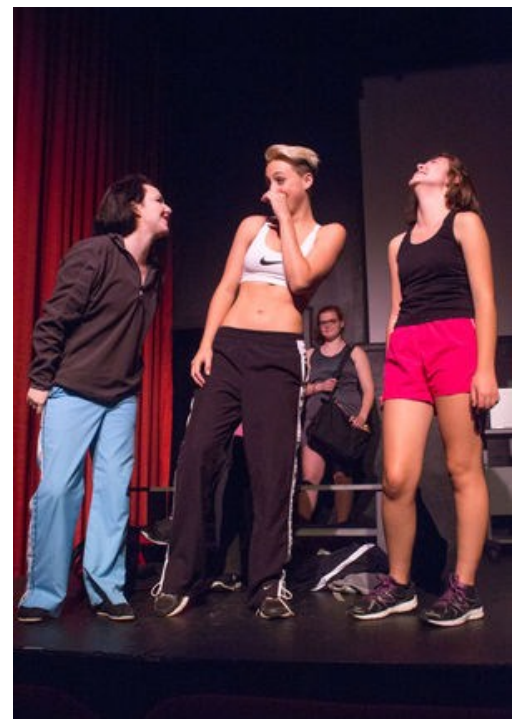
Actors perform Slut: The Play at the Crystal Theater in Missoula.

The theory behind this play is theater as social change. Audience reactions and media coverage of the play speak to the effectiveness of this innovative prevention effort. In fact, the public support for the play has already resulted a planned revival of the play in April 2016 during Sexual Assault Awareness Month with a performance in Missoula, and then two performances in Helena, MT, supported by the Montana Coalition Against Domestic and Sexual Violence (MCADSV) and Helena's Friendship Center.