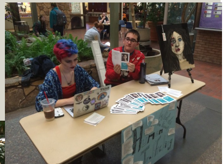
GLI students provide anti-trafficking information at a table in the University Center.