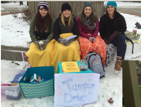
A GLI group hosts a tampon drive on campus.