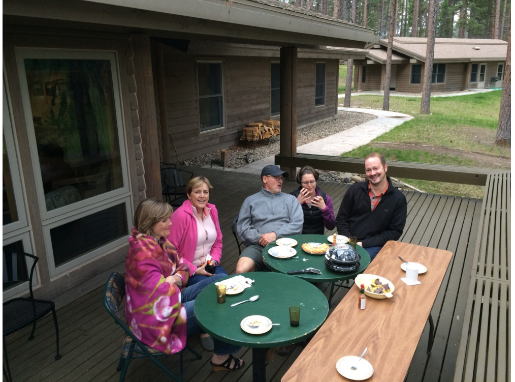
The 2015 Spring Retreat group at Lubrecht National Forest.