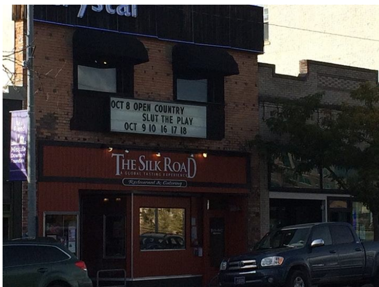
The marquee at the Crystal Theater.