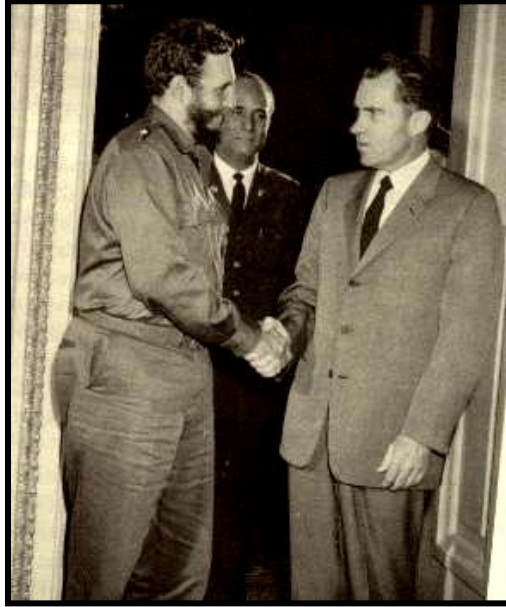
Fidel Castro and U.S. V.P. Richard Nixon, Washington, D.C., April 15, 1959