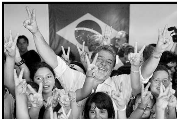
Luis Ignacio (LULA) da Silva, President of Brazil, 2002-2011