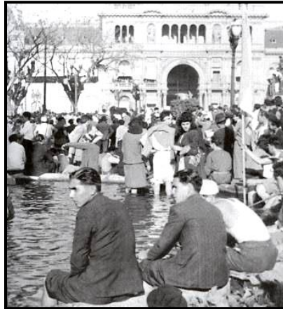
Descamisados in front of the Casa Rosada in the Plaza de Mayo Buenos Aires, October 17-18, 1945