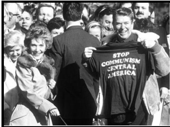
Ronald Reagan, 40 th U.S. President (1981-89), and First Lady Nancy

Separate handouts and/or class discussions will be provided for these requirements.