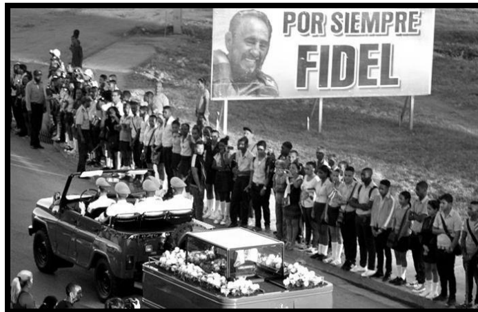
Fidel Castro's ashes, Santiago de Cuba, December 4, 2016