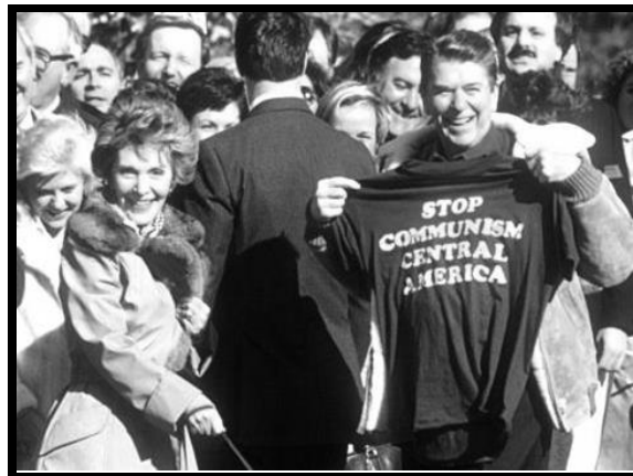
Ronald Reagan, 40 th U.S. President (1981-89), and First Lady Nancy

Separate handouts and/or class discussions will be provided for these requirements.