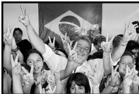
Luis Ignacio (LULA) da Silva, President of Brazil, 2002-2011