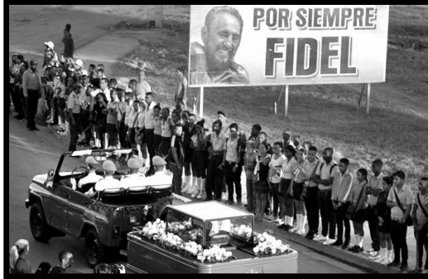
Fidel Castro's ashes, Santiago de Cuba, December 4, 2016