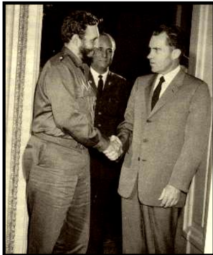
Fidel Castro and U.S. V.P. Richard Nixon, Washington, D.C., April 15, 1959