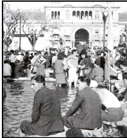
Descamisados in front of the Casa Rosada in the Plaza de Mayo Buenos Aires, October 17-18, 1945